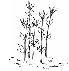
Good Ground! VERSE 8