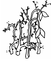
Thorns VERSE 7