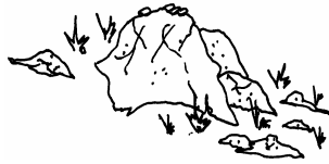
Rocky Ground VERSE 6